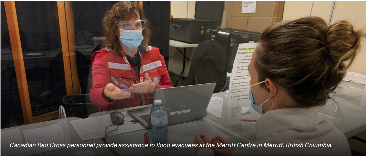
Canadian Red Cross personnel provide assistance to flood evacuees at the Merritt Centre in Merritt, British Columbia.